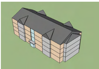
Alternate Massing Options

College and university administrators and campus housing officers face new challenges as they prepare to accommodate the next generation of students. Traditional residence halls offer little flexibility in housing different classes with differing spatial needs and expectations. Fixed floor plans, designed specifically for doubles, singles or suites, limit housing options when there is a change in demand. Reconfiguration usually requires costly structural changes and considerable construction time.